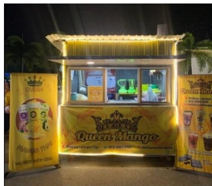
Figure 1.1 MSME Queen Mango